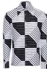
HIGH CONTRAST PATTERNS