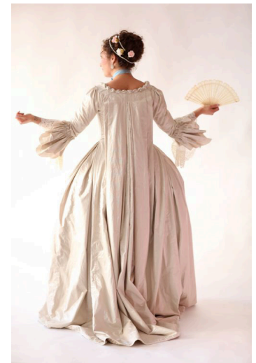
FABRIC / DRAPERY