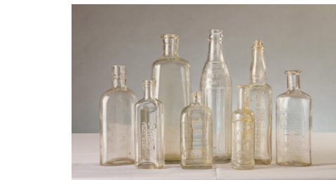
FULLY REFLECTIVE / SHINY METAL CLEAR/TRANSPARENT