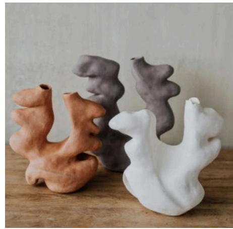
LOTS OF FEATURES / ASYMMETRICAL MATTE SURFACE / LIGHT COLORS