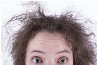
LONG FUZZY / FRIZZY HAIR