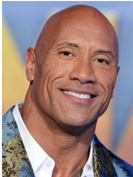
GROOMED HAIR / NO HAIR